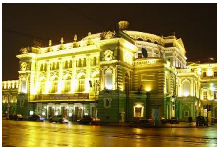
A highlight will be a visit to the ballet or theatre in St Petersburg