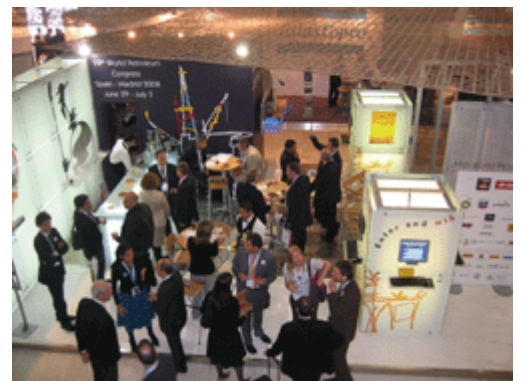
Día de las tapas on the 19th WPC stand